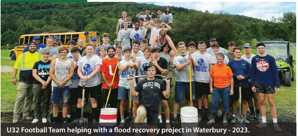
U32 Football Team helping with a flood recovery project in Waterbury - 2023.

Clean up efforts can be scheduled prior to Green Up Day and any time of the year. Email for information.